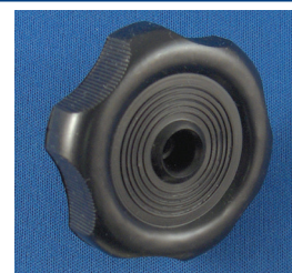
2-1/4" Outside Diameter Plastic Knob Handle w/Screw