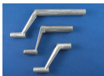
Metal Crank Handle w/Screw