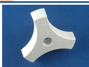
2-1/8" Outside Diameter Kinro Knob Handle w/Screw

Each Display Contains 3 each of the following window handles.