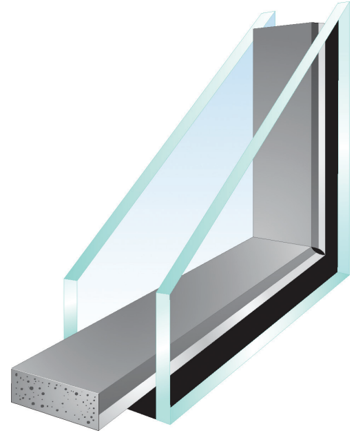
Energy efficient Super Spacer®

Featuring a vapor barrier backing, the product must be used in combination with conventional IG sealants such as hot melt butyl, polyurethane and solvent-free polysulfide. Dual seal equivalent sealants may also be used.