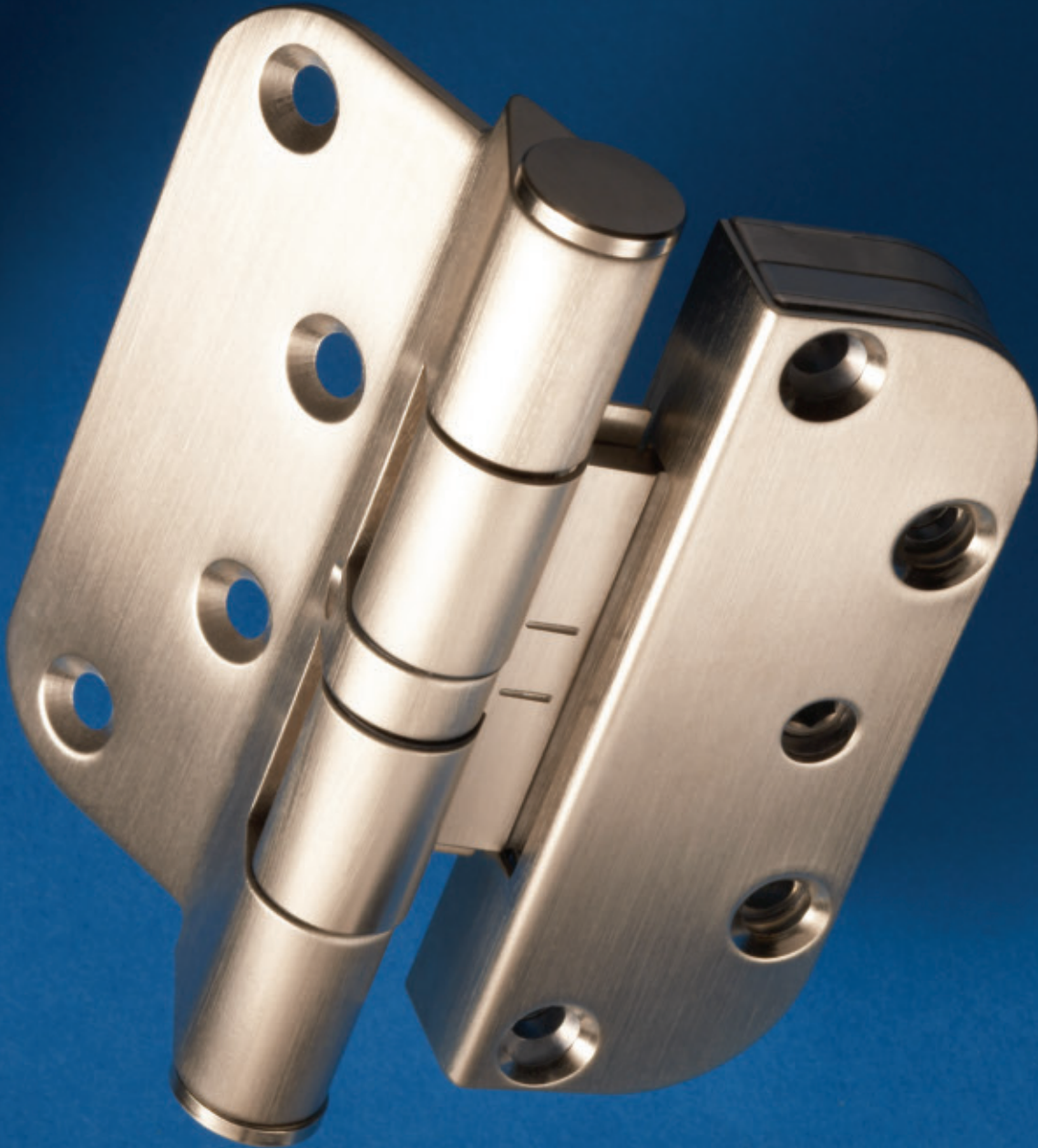
HOPPE Adjustable Hinge