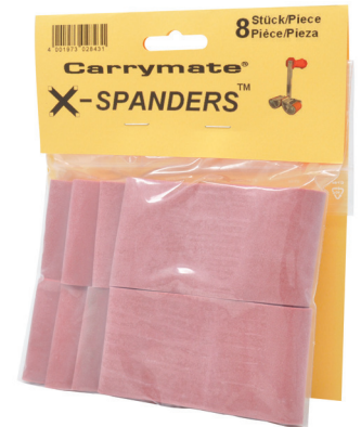
59-177X Carrymate® X-Spanders. Simply slip the X-Spanders over the clamps! No glue is necessary! Sold in packs of 8.