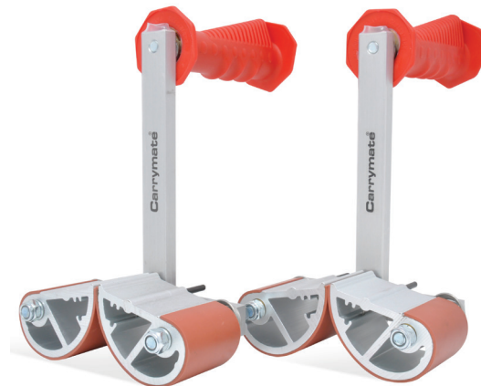
59-177 CARRYMATE® 5 Span width 0-3.15" (Pair)